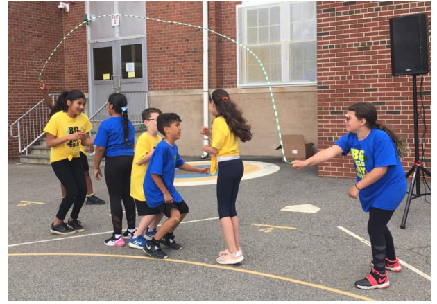
Beatrice Gilmore students enjoyed a fun filled Field Day on June 14 with a number of activities.